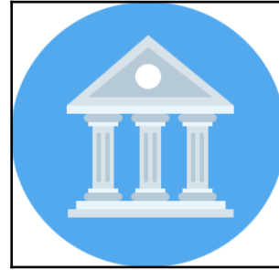
Hatton National Bank PLC